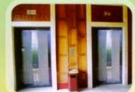
Passenger Service Lifts