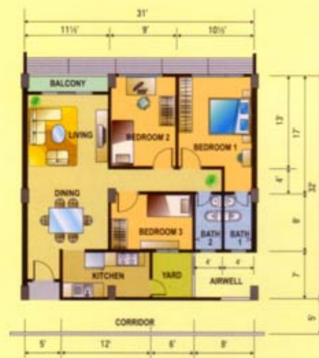
TYPE C Floor Area: 928 sq.ft.