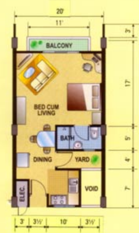
TYPE D Floor Area: 560 sq.ft.