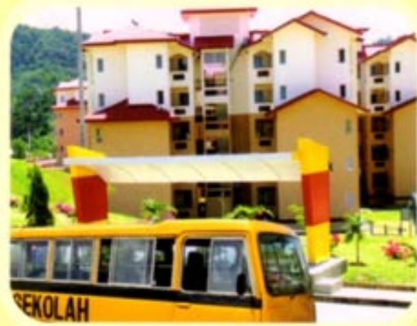
Covered Bus Stop