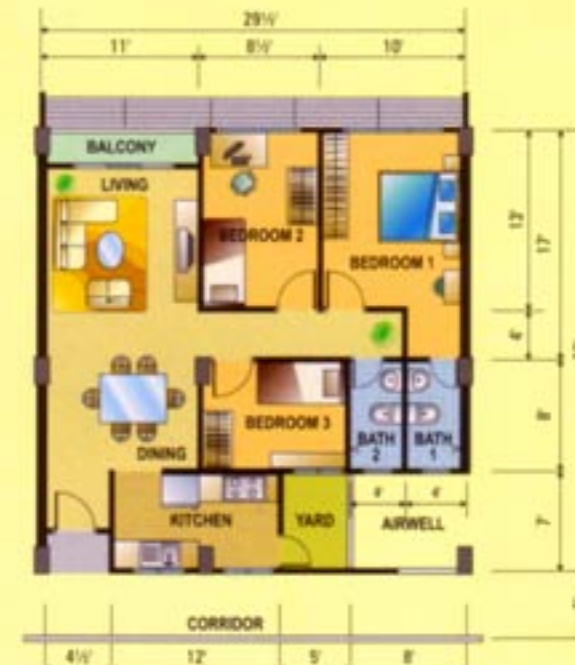
TYPE B Floor Area: 874 sq.ft.