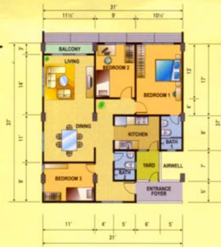
TYPE A Floor Area: 1,068 sq.ft.